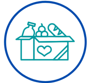
Health, Wellness & Independent Living