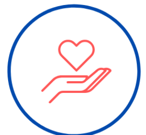
Capacity Building & Local Priorities

YOUR support helps our programs serve the needs of more Iowans