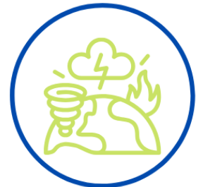
Disaster Services & Environmental Stewardship