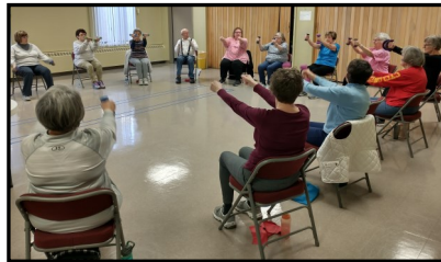
New BASE Senior Fitness Class—Fort Dodge