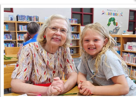
Pen Pals at South Hamilton Elementary