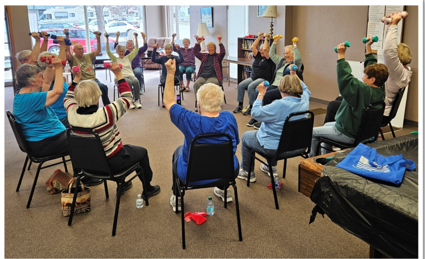
"ACE" BASE group which meets at the Webster City Senior Center

Please contact me if you would like to join or start a BASE class in your area.