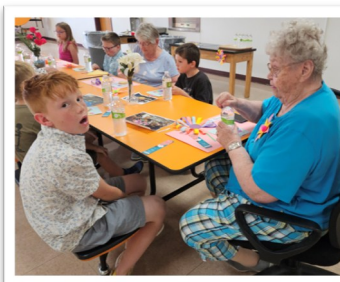
Pen Pals at Stratford Elementary