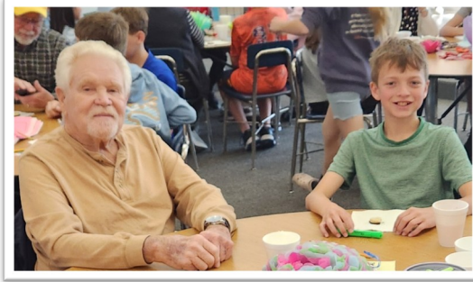
Pen pals at Webster City Middle School