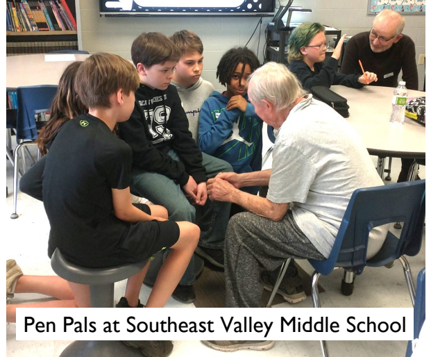
Pen Pals at Southeast Valley Middle School