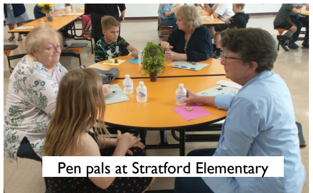
Pen pals at Stratford Elementary