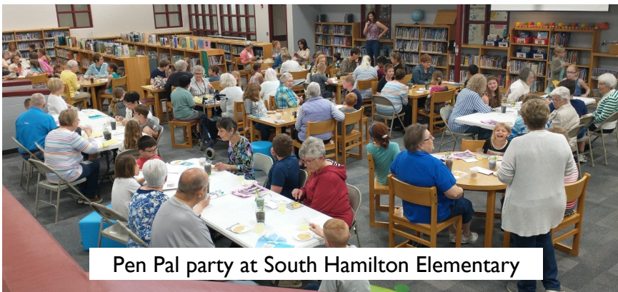
Pen Pal party at South Hamilton Elementary