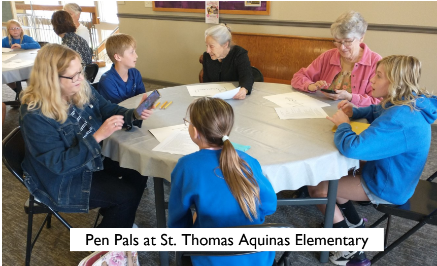
Pen Pals at St. Thomas Aquinas Elementary