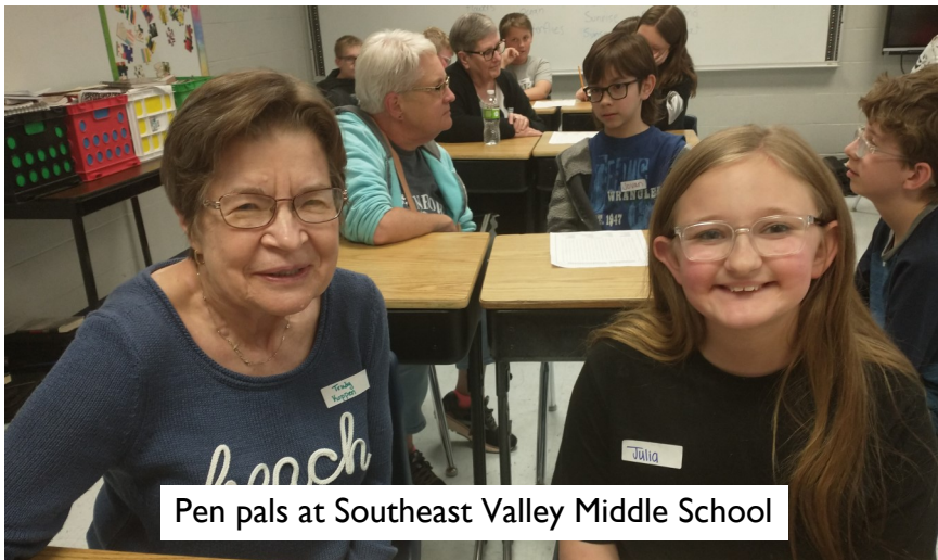
Pen pals at Southeast Valley Middle School