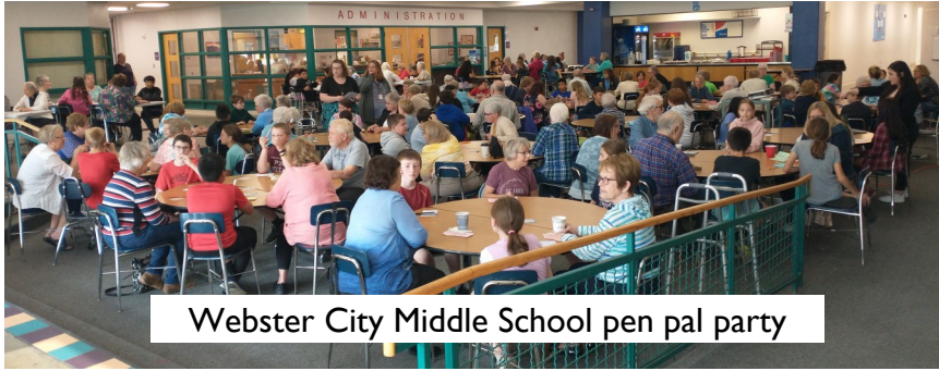
Webster City Middle School pen pal party