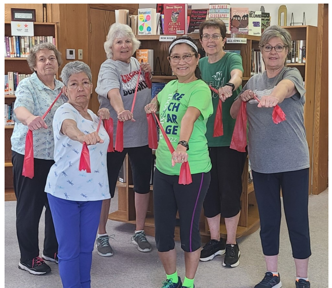
BASE class at Badger Public Library