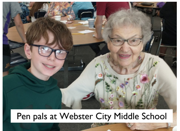
Pen pals at Webster City Middle School